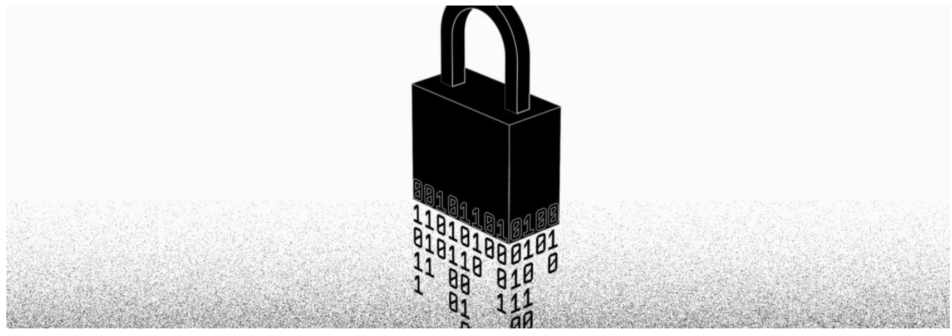
On the Tech Radar: Upcoming Events